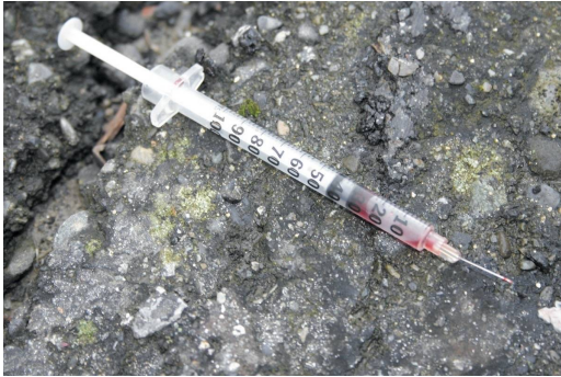
Discarded needle (uncapped)